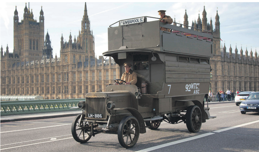
Travelling through time: See the restored Battle Bus on display at Covent Garden

SEE A VETERAN VEHICLE AT LONDON TRANSPORT MUSEUM