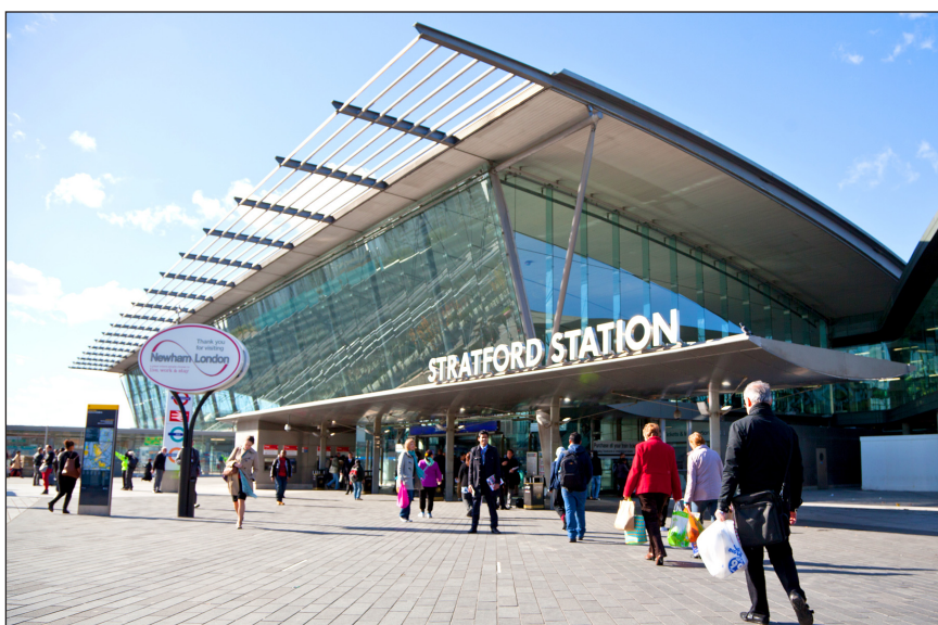
Stratford – one of the beneficiaries of a transport infrastructure cash injection

THE Mayor has announced details of four transport projects set to receive a share of a £40million fund allocated for regeneration schemes.