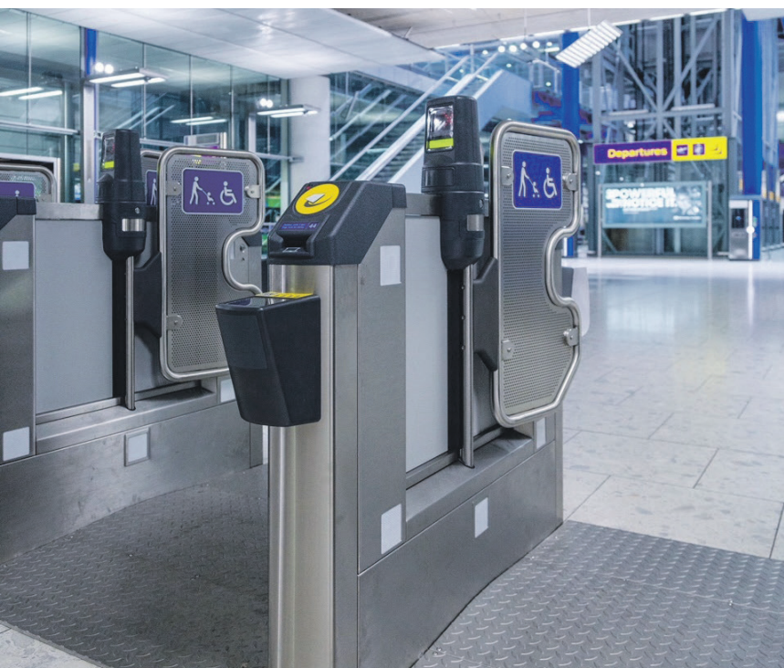
Airport bound: Passengers will be able to use pay as you go to Heathrow from May