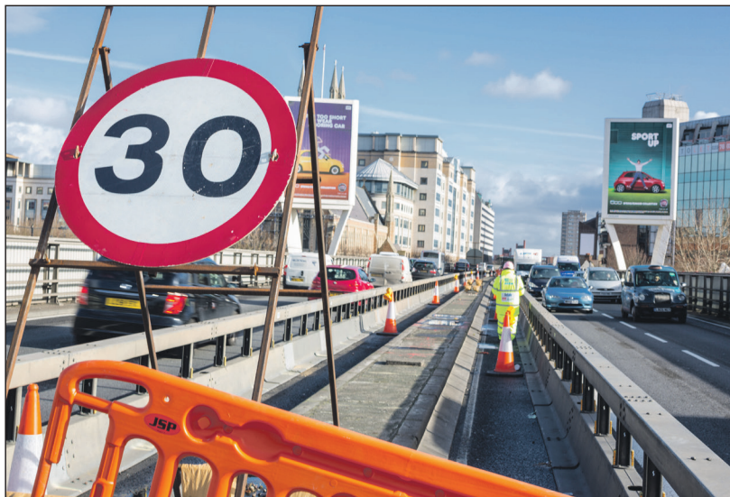
Road Modernisation Plan for London and is the biggest investment in the

The restoration of the flyover has been under way since October 2013 and should be fully completed by the end of this summer. It forms part of TfL's £4bn