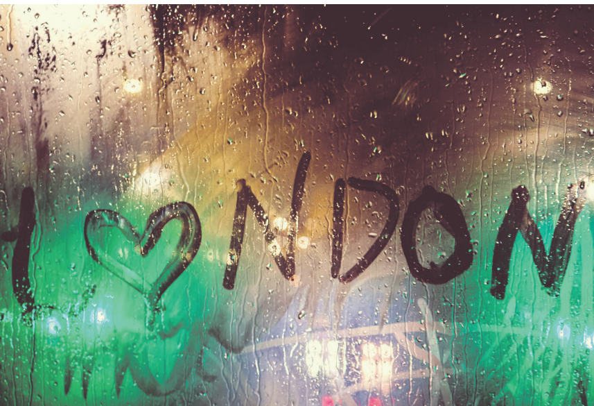
Race for space: Have your say at London Transport Museum's Late Debate