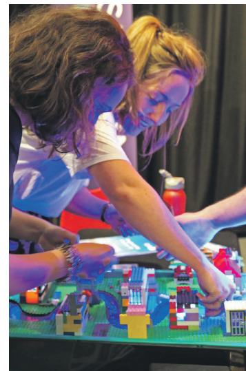
Building blocks: There's plenty to see and do at the museum

GET two tickets for the price of one by using the online code 241Earlybird . Book by 11.59pm on Sunday November 11.