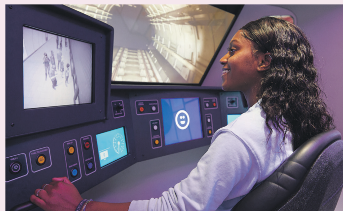
Future Engineers: Try your hand at driving a new Elizabeth line train

Then try out a state-of-the-art palm scanner (the latest in ticketing technology) and an Elizabeth line driving experience, where you can climb into a replica train cab and use a computer system to navigate your way through tunnels.