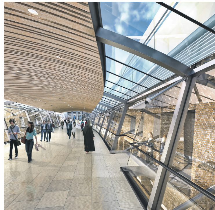
An artist's impression of the new and improved Whitechapel station

It will take just three minutes to travel to Canary Wharf and seven minutes to Tottenham Court Road.