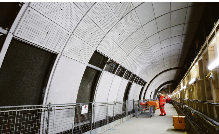
Sneak peek: The new Tottenham Court Road station being built by Crossrail Limited

A fun design competition for young people could see them win a guided tour of one of the new Elizabeth line stations.