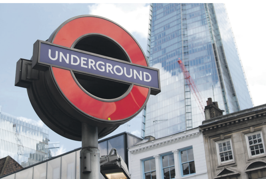
Plan ahead: Passengers on the Jubilee line are advised to check before they travel

The growing network of over 1,700 pedestrian street signs make a walk around London easier for everyone to enjoy