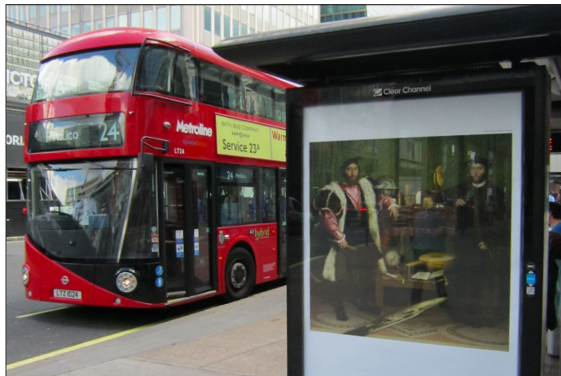
Millais's 'Ophelia', Turner's 'The Fighting Temeraire' and Lowry's

A total of 57 British masterpieces are featured. They include Waterhouse's 'The Lady of Shalott',