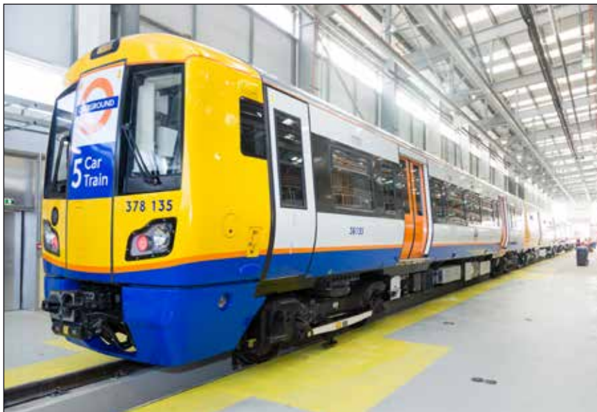
Look out for new five-car trains boosting capacity on London Overground

A HUGE programme of improvement and maintenance work on London's road and public transport network was completed over the festive period, saving road users from more than 20 weekends of repeated disruption.