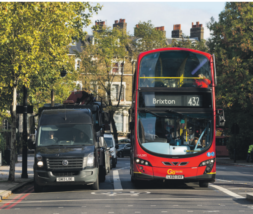
Breathe easy: Brixton was one of the first of London's Low Emission Bus Zones