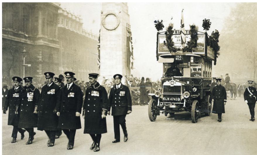
Paying respects: A B-type bus passes the Cenotaph in the 1923 Armistice Day Parade