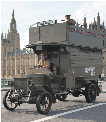
A piece of history: See London Transport Museum's restored B-type Battle Bus

The Battle Bus will be on display afterwards at London Transport Museum, Covent Garden, until spring 2019. Families are also invited to visit the museum between 11am and 3.45pm tomorrow or Sunday, to make poppies and learn about the role of bus drivers during the war.