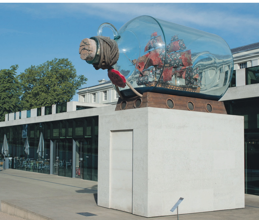
Oh buoy: Have a go at making your very own ship in a bottle