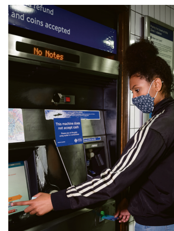
Cover up: Face coverings are mandatory on all TfL services

Disabled Person's Freedom Pass. For more information on TfL's fares, visit tfl.gov.uk/fares