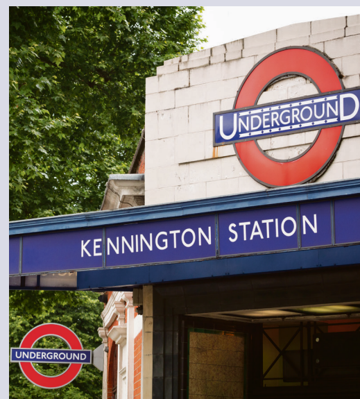
All change: Kennington is now a Zone 1/2 station

AHEAD of the opening of the Northern Line Extension this autumn, Kennington station has changed from a Zone 2 to a Zone 1/2 station this week.