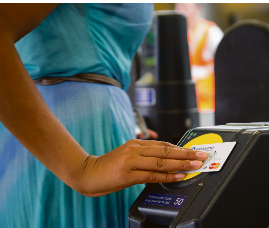
Fares fair: Always have a valid ticket to travel, and remember to touch in and out