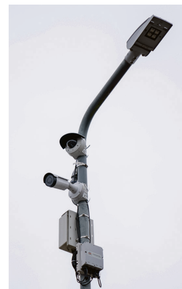
Candid camera: The cameras can be adapted for each location

Speed limits have also been reduced to 20mph on a number of roads across the capital and TfL is currently consulting on reducing the speed limit on 13km of roads within Westminster.