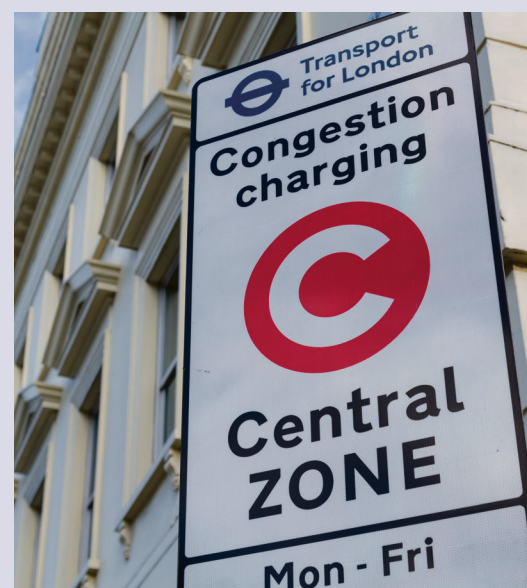
In the zone: Changes to how the Congestion Charge operates in London are under consultation

The consultation is open until October 6 2021. For more information and to have your say on the consultation, visit tfl.gov.uk/ccyourview