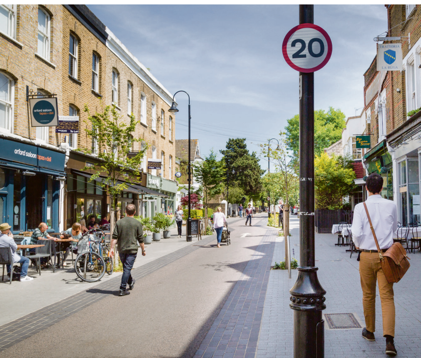
Safe for all: A number of programmes, such as 20mph zones, are making roads safer