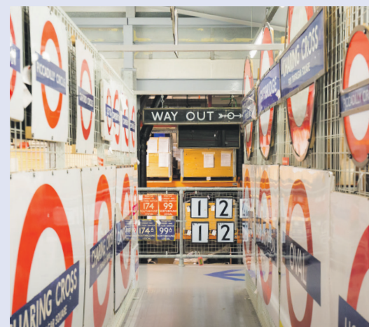
Acton Depot Open Weekend: Book your ticket now

For more information and to book tickets, visit the website at ltmuseum.co.uk