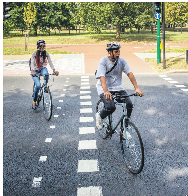
Cycling and walking: More space provided on roads to encourage this

For the latest travel advice and information, visit tfl.gov.uk