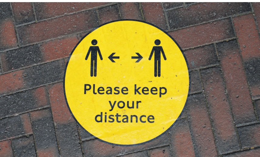
Social distancing in the city: Everyone should ensure they keep two metres apart