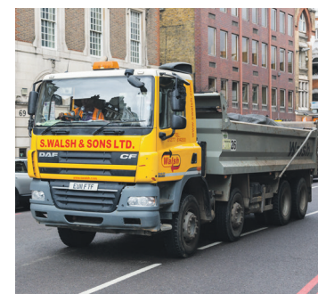
Direct vision: Standards are set to tighten further in October 2024