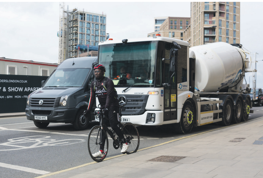
Leading the way: Enabling more Londoners to walk and cycle safely is a top priority