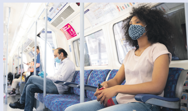
Stay cool: Carry water with you when travelling during hot weather

To check your travel, including downloading the real-time TfL Go app, visit tfl.gov.uk/travel-tools