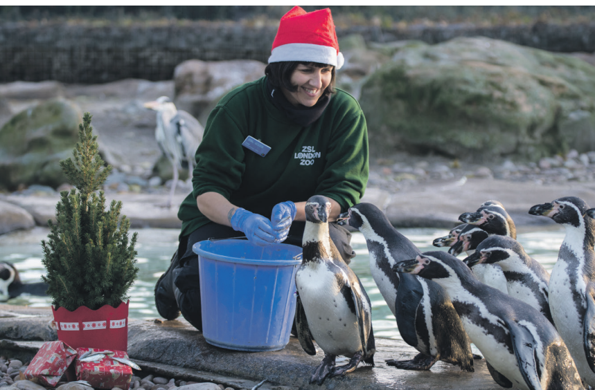
Fishy feast: It's penguin-ing to look a lot like Christmas at London Zoo this year