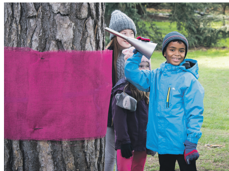
Family fun: Wrap up and connect with nature at Kew Gardens

For more articles and to keep up to date with TfL announcements, visit tfl.gov.uk/news