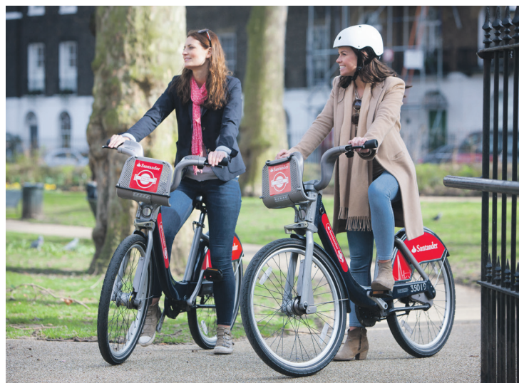
Saddle up: Enjoy a fun day out in the capital on a Santander Cycles bike

Customers who use the service road are advised to find an alternative route.