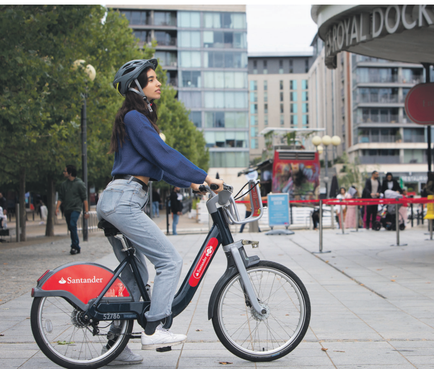
Bargain: Did you know you can hire a Santander Cycles bike for as little as £2 a day?