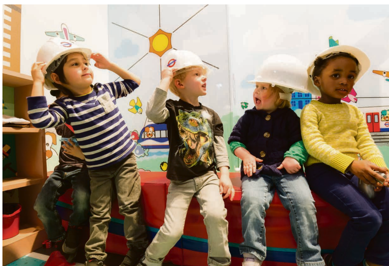
Faces of the future: Budding engineers can enjoy hands-on activities

These sessions explore some of the technology currently used at Tube stations across London. Try your hand at making