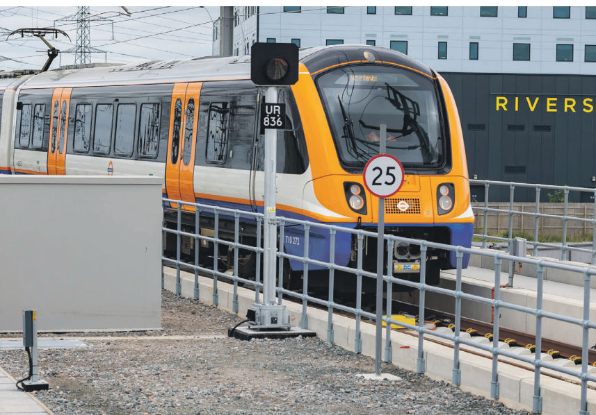
Opening soon: The 4.5km line will improve transport connectivity and accessibility