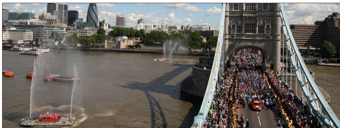
Cyclists cross Tower Bridge during the 2007 Tour de France.

Road closures for the event through north, east, and central London will begin after the morning peak at 10am, with roads reopening as quickly as possible once the Tour has passed