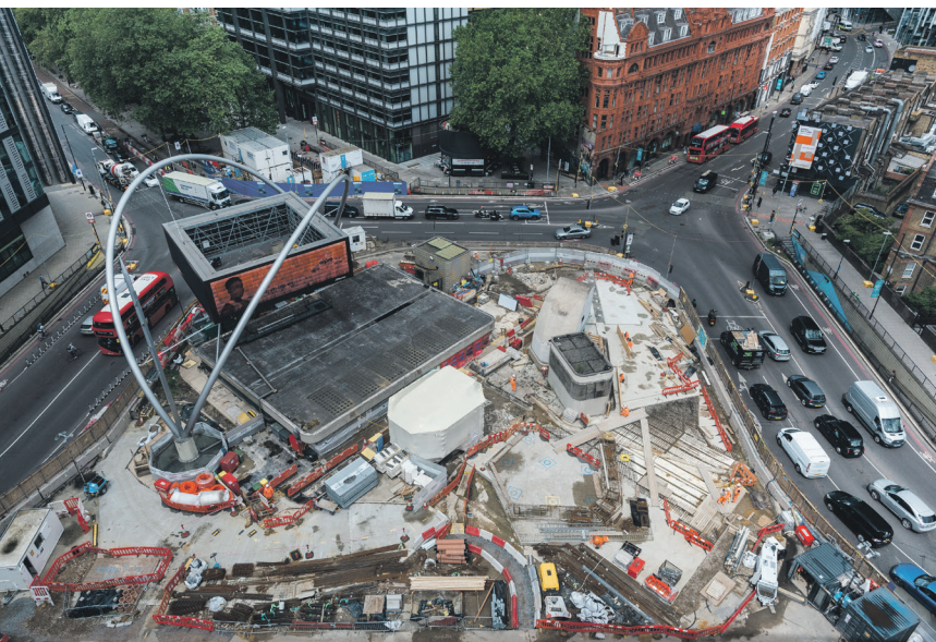
New look Old Street: The works will make the area pedestrian and cycle-friendly