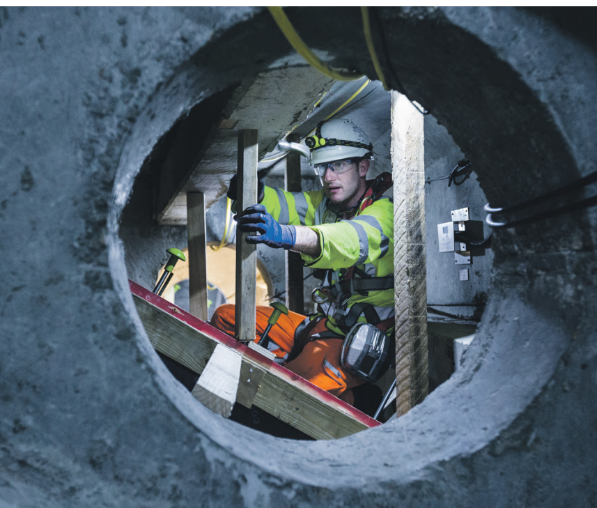
Essential maintenance: Work to Cromwell Road Railway Bridge will start this week