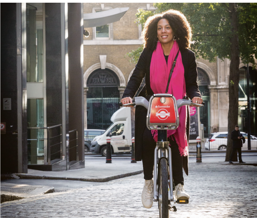
En route: The Cycling action plan will make cycling easier, safer and more accessible