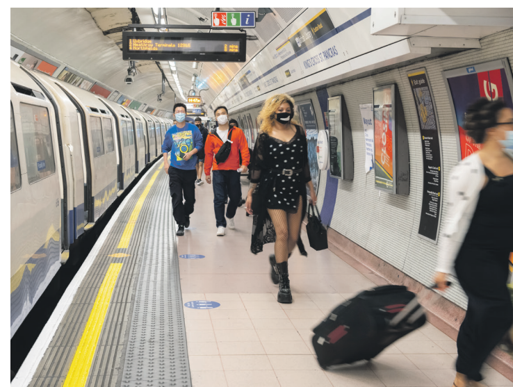
Keep them on: Wear your face covering for the duration of your journey

'I urge everyone to continue to follow the advice and requirements, including to wear face coverings while travelling on our network, so that we can continue to build confidence, and get back to the many wonderful things about London that we have missed during the pandemic.'