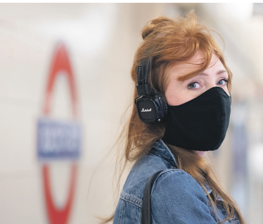
Covered up: Face coverings must still be worn while travelling on public transport