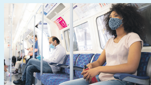
Stay cool: Carry water with you in hot weather

For help with planning your journey, including downloading the real-time TfL Go app, visit the webpage at tfl.gov.uk/travel-tools