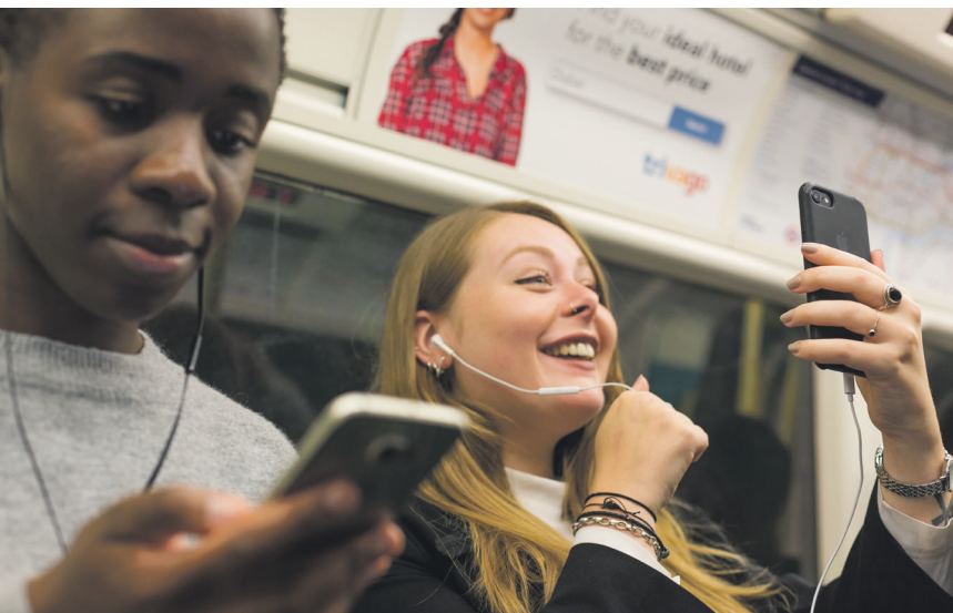
Connecting the capital: Customers using their phones in a tunnel on the Jubilee line