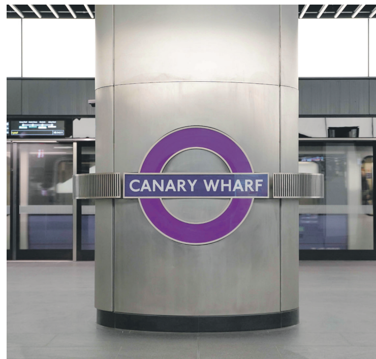
Railway on track: Canary Wharf is the ninth station transferred to TfL

stations are now the responsibility of TfL, and Crossrail is currently focused on completing works at Bond Street.