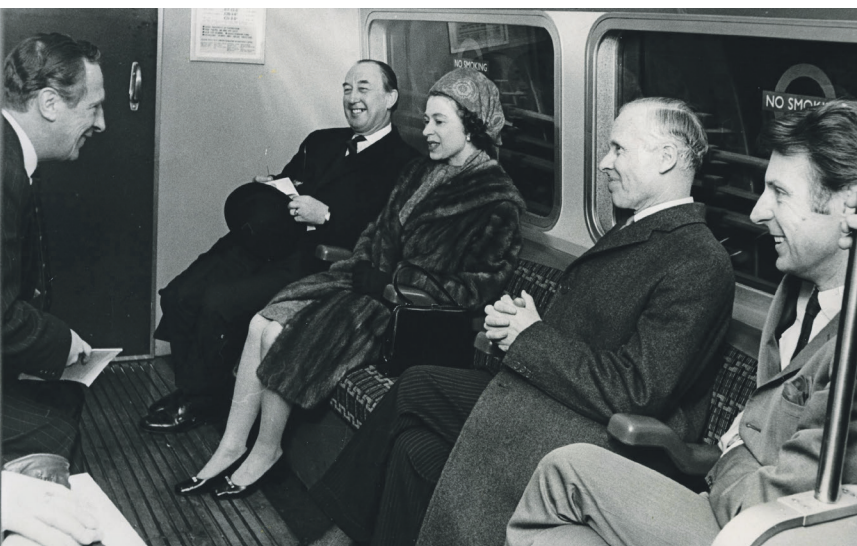
Royal approval: The Queen rode on the Victoria line when it opened in which year?