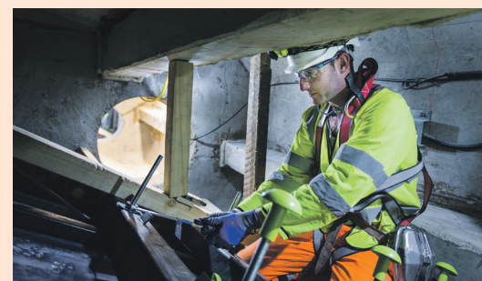
Check ahead: There will be a series of closures

The essential maintenance is needed on the Cromwell Road Railway Bridge, which carries the A4 over the train lines between Gunnersbury and Kew Gardens stations.