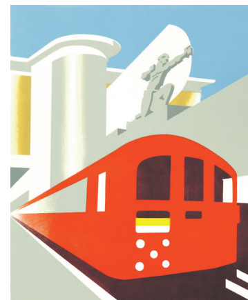
Perfectly restored: The 1938 Stock has an Art Deco interior

The Sunday trips are on the same day as Amersham's Old Town annual Heritage Day, which includes children's funfair rides, classic car displays, a vintage farmers' market, a birds of prey display and heritage bus journeys.