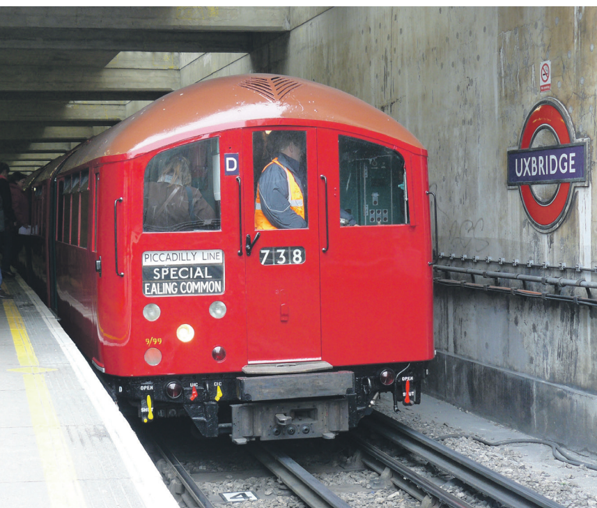
Time machine: Transport yourself back to the 1930s with a ride on a vintage train