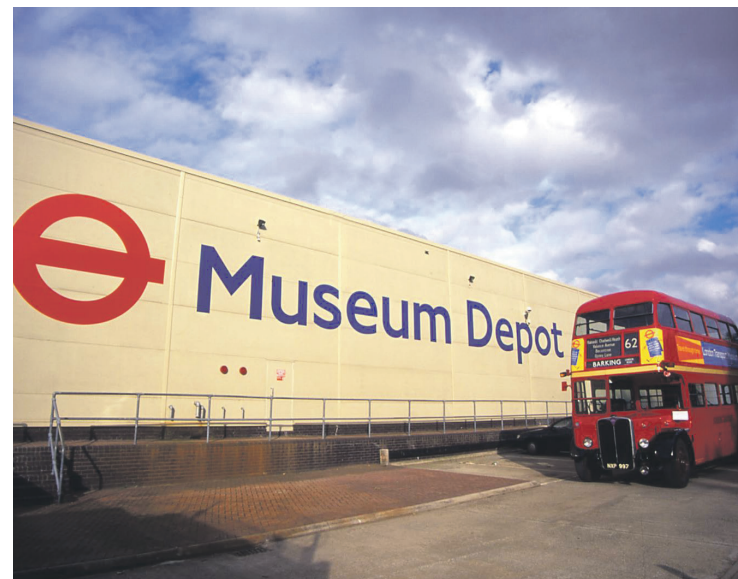
Family fun-filled days: The London Transport Museum Depot in Acton houses more than 320,000 artefacts from the capital's transport history including buses, Tube trains and posters LONDON TRANSPORT MUSEUM

safe, local, fun day out during the summer holidays. With social distancing and new safety measures in place, we can't wait to welcome people back to experience the depot.'