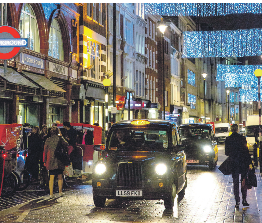
Travel safe: Black cabs can be hailed and also booked via app, phone or online