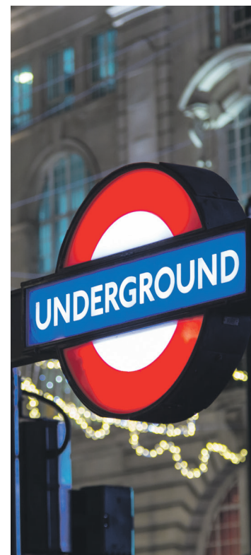
Party planning: The 24-hour Night Tube runs on Fridays and Saturdays

London Buses run services 24 hours a day and, thanks to the Mayor's Hopper fare, it costs just £1.50 for unlimited bus and tram journeys within one hour of first touching in.