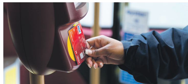
Touching in again: Board at the front and use the card reader to pay

Everyone who can work from home should continue to do so. If you do need to travel, consider walking or cycling instead of car travel, where possible. Those who do need to make an essential journey on public transport should avoid travelling on the network during the busiest times, between 5.45am and 8.15am and 4pm and 5.30pm. Customers are also asked to wear a face covering, maintain