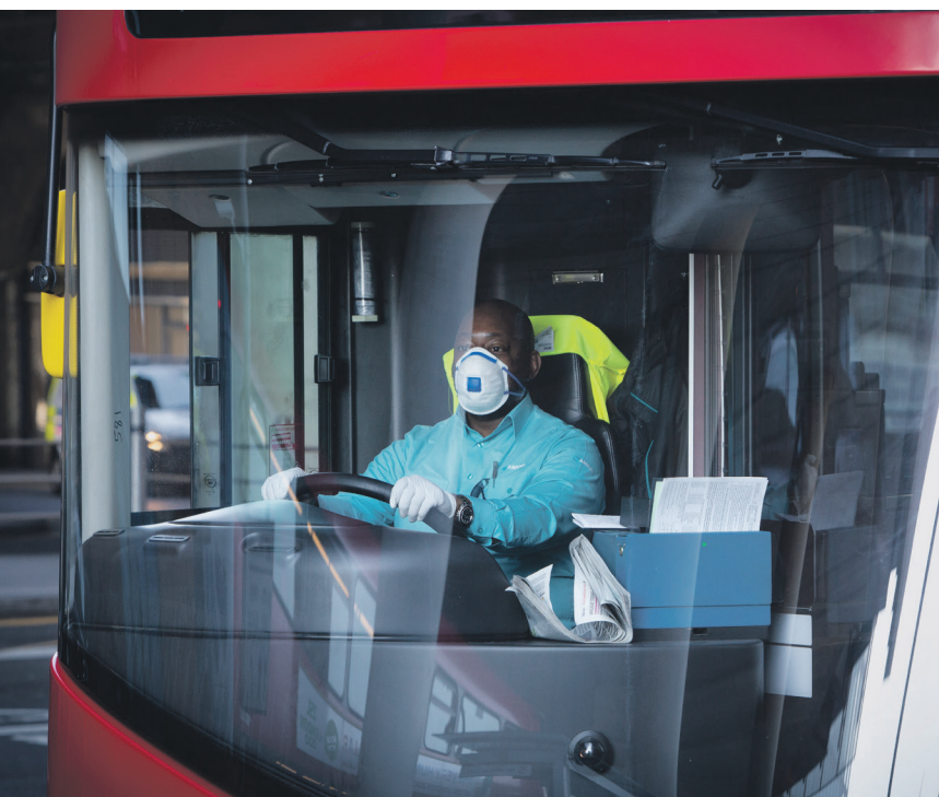
Keeping drivers safe: Protective layer added and all communication gaps sealed