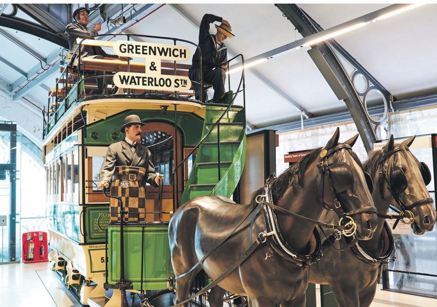
Giddy-up: Hop over to Covent Garden for a dose of the capital's transport history

AFTER CLOSING FOR 173 DAYS, THE MUSEUM IN COVENT GARDEN IS OPEN ONCE AGAIN