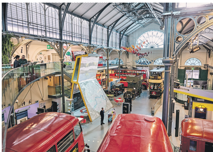
Transport of delight: Admire the fascinating vehicles of yesteryear

Send your answer, name and address, along with the subject title 'Museum tickets', to metrocompetitions@tfl.gov.uk . Entries must be received by 11.59pm tonight. Winners will be chosen at random. For full terms and conditions, visit tfl.gov.uk/terms