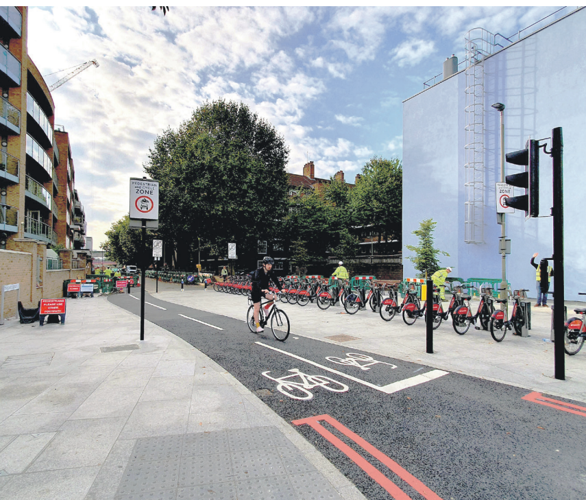
Safer streets: It's now easier to walk, cycle and use public transport in the area