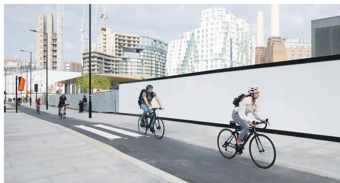
All change: Residents have access to the two new Tube stations at Nine Elms and Battersea Power Station

For more articles and to keep up to date with TfL announcements, visit tfl.gov.uk