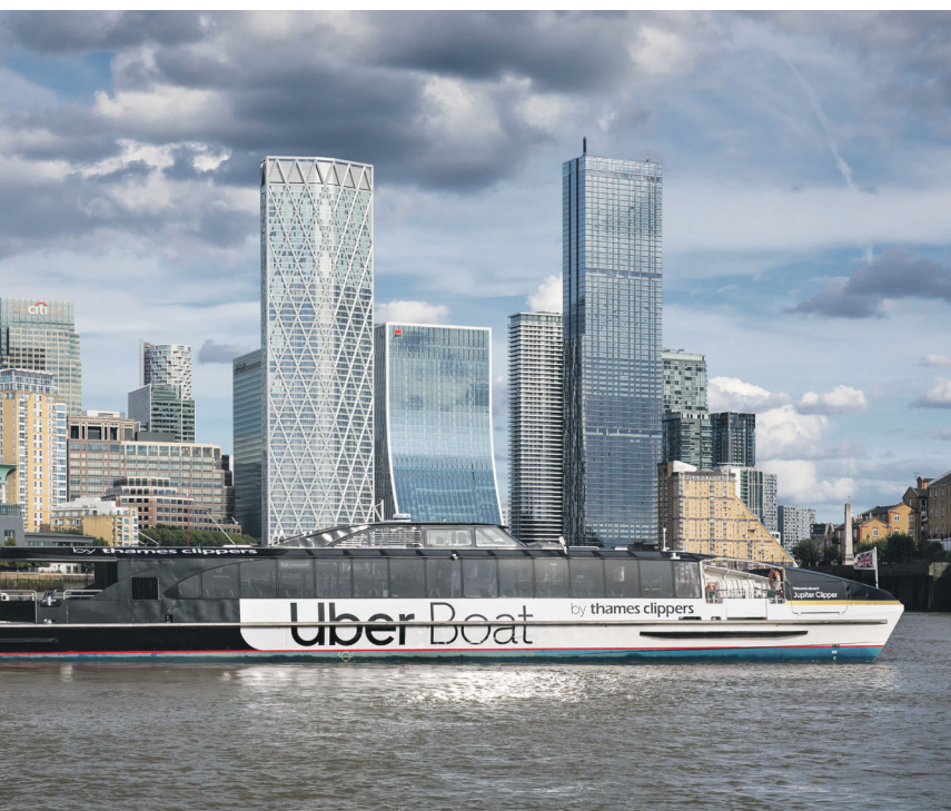
Rolling down the river: Enjoy the city sights with an Uber Boat by Thames Clippers