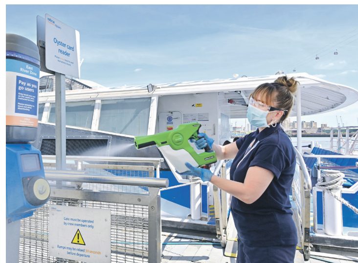
Keeping it clean: There are a number of protective measures in place

For more information about the recent changes and London's river services, visit tfl.gov.uk/river