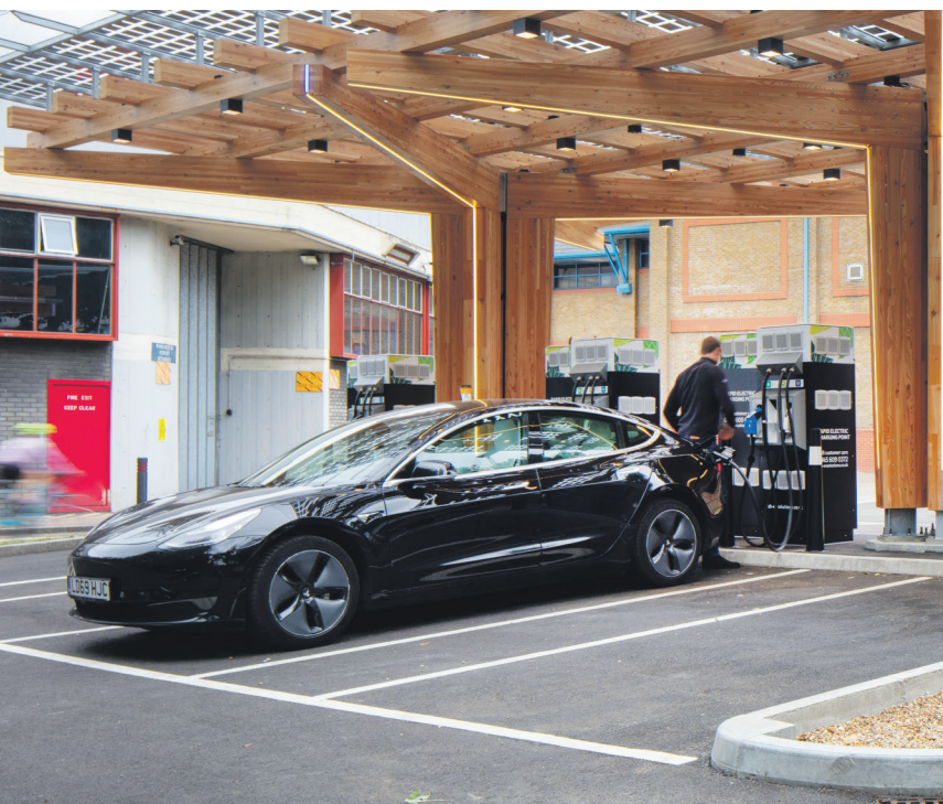
Rapid charging hub: Drivers can charge their electric vehicles in just 20-30 minutes