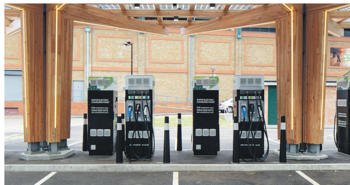
Powering up: TfL's Glass Yard hub in Woolwich, south London, offers eight charging points for electric vehicles

In partnership with the city's 33 boroughs through the Go Ultra Low Cities scheme, more than 3,000 residential charging points have already been delivered. The points enable drivers to plug their vehicle