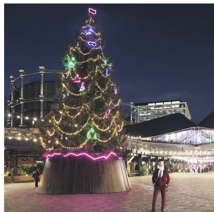
Tree-mendous: Plan a trip to see some of the capital's most spectacular and unusual Christmas trees of 2022, including the display at St Pancras International (left) and Coal Drops Yard JOHN STURROCK