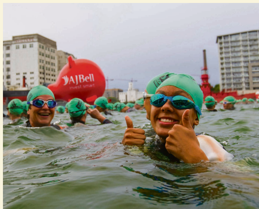
Splashing time: The world's largest triathlon heads to London Docklands JAMES BELLORINI

Tickets cost £8 for adults and £4 for children aged five-12. For more details, visit tfl.gov.uk/dlr-discovery