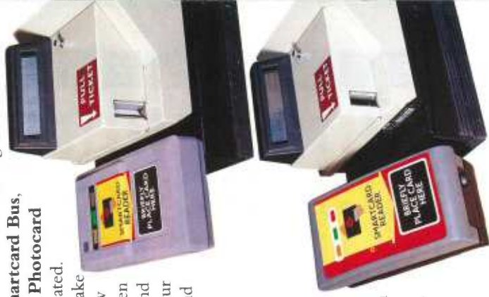
The cardreaders are alongside the driver's ticket machine.

Please remember to keep your Bus Pass, Permit or Travelcard with you at all times as the bus driver or an inspector may need to see it.