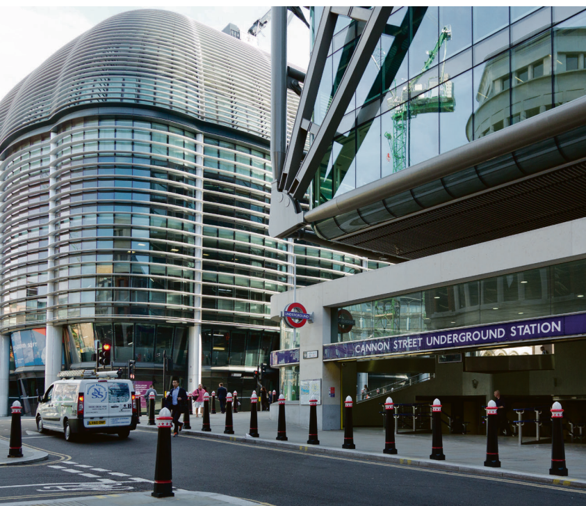
Station history: Cannon Street Underground station opened on October 6, 1884