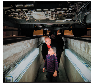
Underground's iconic logo. There will be talks and displays

Transport typeface. They can also discover more about London