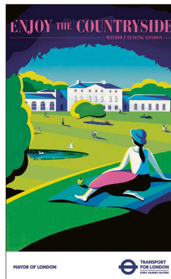
Enjoy the Countryside without leaving London, Jack Hudson, 2016