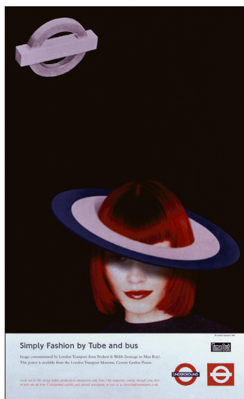
Simply Fashion, Trickett & Webb, 1999