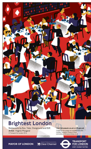
Brightest London Restaurants, Virginie Morgand, 2016