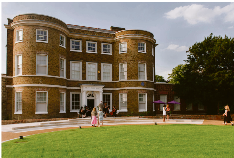
Historical: Visit William Morris Gallery for a day of culture WILLIAM MORRIS GALLERY

Carry on along Euston Road to King's Cross St Pancras for an unusual afternoon at the London Canal Museum, which also doubles up as a monument to the Victorian ice cream industry.