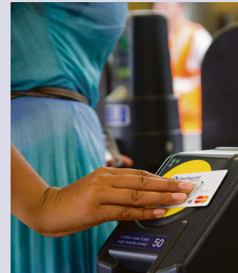
Off-peak fares: Travel in Zones 2-6 this summer for just £1.50

For more information on fares, visit tfl.gov.uk/fares