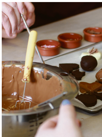
Sweet stuff: Learn all about the history of chocolate CHOCOLATE MUSEUM

For more inspiration to help you plan your day out, visit londonblog.tfl.gov.uk