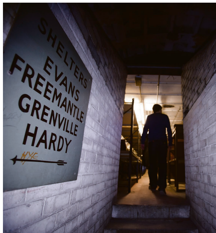
Take a tour: Go behind the scenes at Clapham South Subterranean Shelter

For more information, visit southbankcentre.co.uk