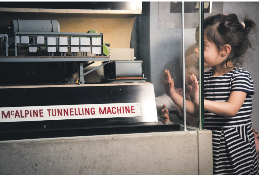
Hands-on: little ones will be able to enjoy getting up close to London's transport history

For a memorable and educational adventure, take a trip to London Transport Museum in Covent Garden.