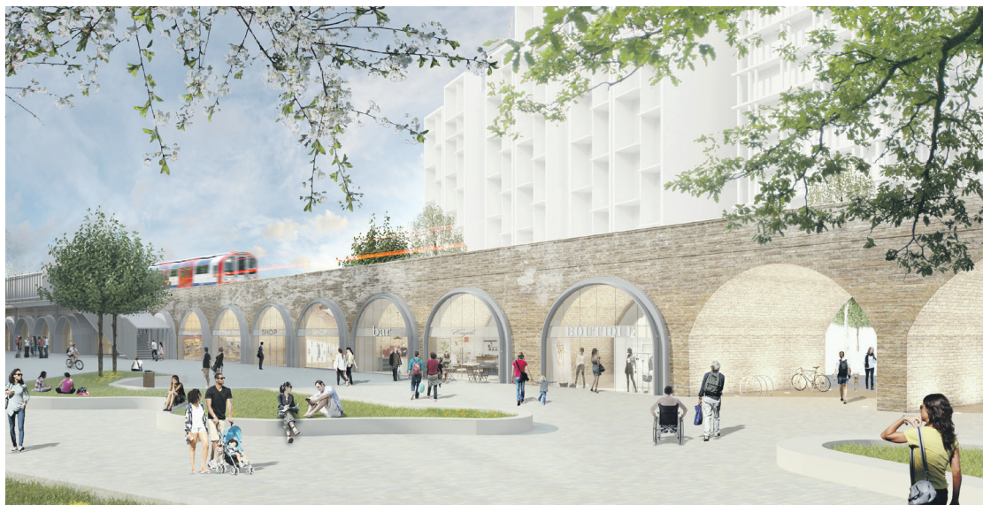
Creating opportunities: An artist's impression of the arches development at Wood Lane

'These are the first of a number of arches that we are looking to develop to help us