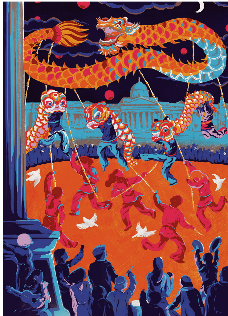
Picture (far left): House of Illustration, Picture (left): Chuan Jia

See more than 100 technical drawings and watercolour illustrations of the architectural backdrops from classic anime films. The exhibition features work from the genre's 1990s heyday, including Production I.G.'s artwork for Ghost in the Shell [top left].