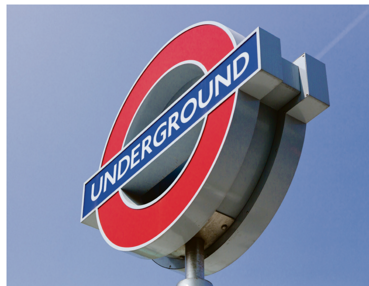
Moving up: Escalator work at St Paul's will improve reliability and safety

The continued modernisation of the Tube is a key part of the Mayor's Transport Strategy to make London a greener, more accessible place. The investment in public transport will help reduce reliance on the car and contribute to the Mayor's target of 80 per cent of journeys made by public transport, cycling or walking by 2041.